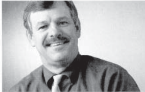
ECHN Health Services 43 West Main St., Suite One, Rockville, CT 860-872-3818