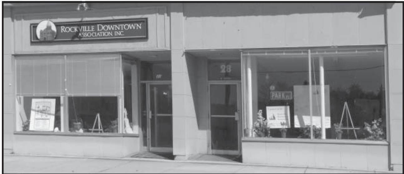
First floor space of the Citizens Block building is ideally suited for prime retail development