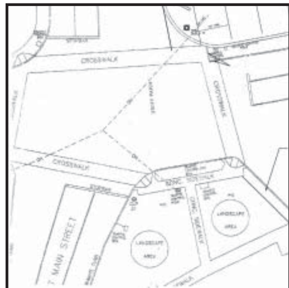
several pedestrian crosswalks eliminated from contract