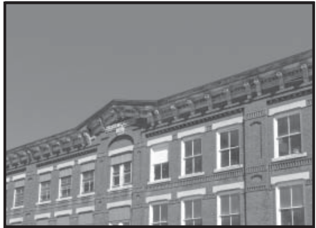
The historic Citizens Block building is slated for redevelopment in the near future